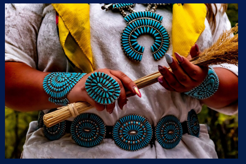
CHANGING WOMAN INITIATIVE

When Indigenous women began the Standing Rock resistance to the Dakota Access Pipeline through their lands, Groundswell Fund's RRF staff visited to learn what leaders on the ground needed in their fight for environmental justice and land sovereignty. Changing Woman Initiative/Mni Wiconi Clinic (NORTH AND SOUTH DAKOTA, 2016—$10,000) set up a midwifery clinic providing comprehensive birthing care at